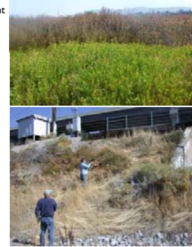
Top: A field of Leafy Spurge in Sandy. Bottom: Control of Leafy Spurge near Winchester Road in SLC, UT.

nerships, created tracking and management systems, and controlled over 80% of the identified Leafy Spurge sites. The GSLRC&D is proud to have given their resources and assistance to this project.