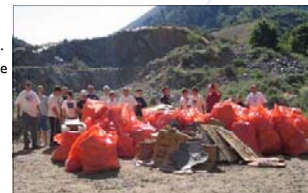
The combined efforts of these youth volunteers totals 243 hours of volunteer work!

A lot of trash was collected by these scouts and their volunteers over three consecutive weekends; the trash was later picked up by UDOT. The efforts of these scouts equaled 243 volunteer hours. The State of Utah recognizes volunteer hours as having a dollar value of $18.83/hour. In total, there was $4,575.69