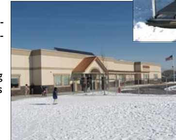
Entheos Charter School with a close up of the photovoltaic solar panels on the roof of the school.